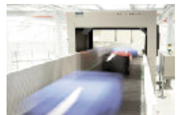
PLM for Production & Supply Chain