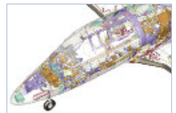
Product Data Management