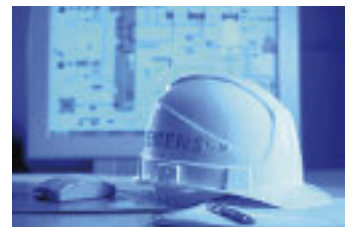
PLM for Service