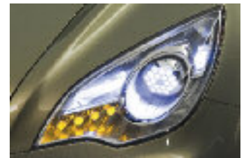
Collaborative Product Design

Siemens IT Solutions and Services is your consultant and architect for process transformation and system integration. We put processes first, because technology renewal in itself will not transform your product results. We turn the exclusive global experience of Siemens manufacturing inside out for your benefit, bringing you best industrial processes and best-fit solutions. Our unique PLM 'how and why' makes the difference.