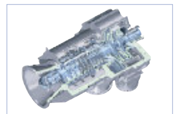
Production Visualization Solutions